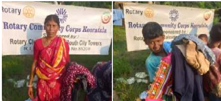
Old clothes being distributed to the underprivileged in the society through our RCC in Keroratala

Continuing its tradition of meaningful community service, the Rotary Club of Calcutta South City Towers recently organized over month long collection and distribution drive of old clothes, toys, books, stationery, shoes, bags, and other essentials during August-September, 2025. These items, collected from generous residents of South City, were delivered to the RCC campus and distributed among underprivileged students and villagers in the Sundarban District.