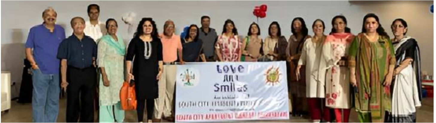
Rotarians and residents of South City at the event for Welcoming the Under-privileged Children to South City just before the onset of Durga Puja