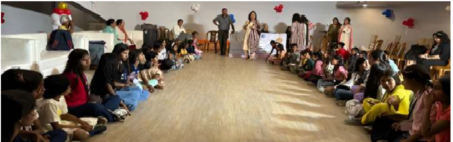
The 55 children from IPER

On 25th September, 55 underprivileged children from IPER (Institute of Psychological Education & Research) in the age group of 6 to 16 years had a rollicking time at the Teenagers Lounge of South City Club. We were absolutely thrilled to see their smiling faces filled with joy. It definitely made our day. Interesting games and dances superbly organized, which churned up the young spirits fully.