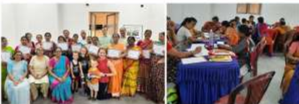
Adult Literacy Program for service staff of South City

Women empowerment initiative. Provide essential reading and writing skills training to illiterate individuals.